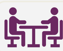
Feedback from staff and leaders